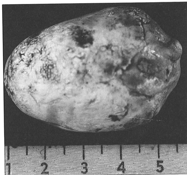
Fig 2 - Giant urethral calculus which presented as a perineal tumour. It measured 70x50x40 mm and weighed 45 g.

Retrograde urethrogram (Fig 1) showed a huge calculus situated in the posterior urethra. Associated urethral pathology was not found in a retrograde urethrogram. Intravenous urography showed normal kidneys, ureters and bladder. The urine was sterile. In September 1991 the calculus was removed under spinal anaesthesia by perineal urethrotomy. It measured 70 X 50 X 40 mm and weighed 45.0 g and was found to be impacted in the posterior urethra (Fig 2). A self-retaining catheter was placed in the urethra for ten days. The patient made a rapid and full recovery.