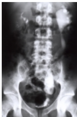
Cover Picture: IVU post-micturition radiograph. (Refer to page 233-237)

Editorial Address Dr C Rajasoorya, Editor Singapore Medical Journal Singapore Medical Association 2 College Road Singapore 169850