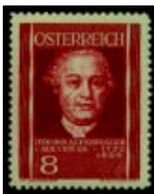
Cover Picture: Josef Leopold Auenbrugger (1722 - 1809): father of percussion (Refer to pages 103-104)

Permit No MITA (P) 111/09/2002 ISSN 0037 - 5675