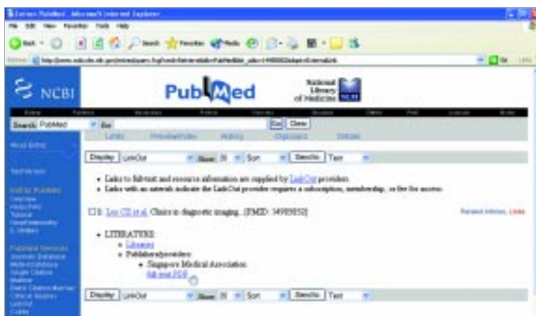
Fig. 4 Page from the PubMed website shows the LinkOut display obtained by clicking "LinkOut" from the Links pull-down menu located on the right side of the SMJ article citation. The full-text of the article on the SMJ website can then be easily accessed.