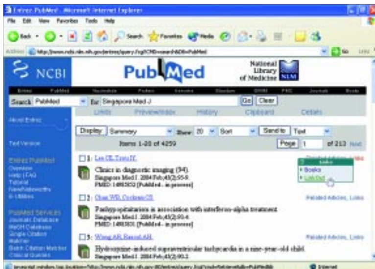
Fig. 3 Page from the PubMed website shows an alternative way of using the LinkOut feature. Clicking the word Links on the right side of the citation will produce a pull-down menu. Clicking "LinkOut" from the pull-down menu will lead the user to the page shown in Fig. 4.

To ensure the widest possible audience for articles published in SMJ, the editorial team has also arranged for SMJ to be connected to LinkOut.