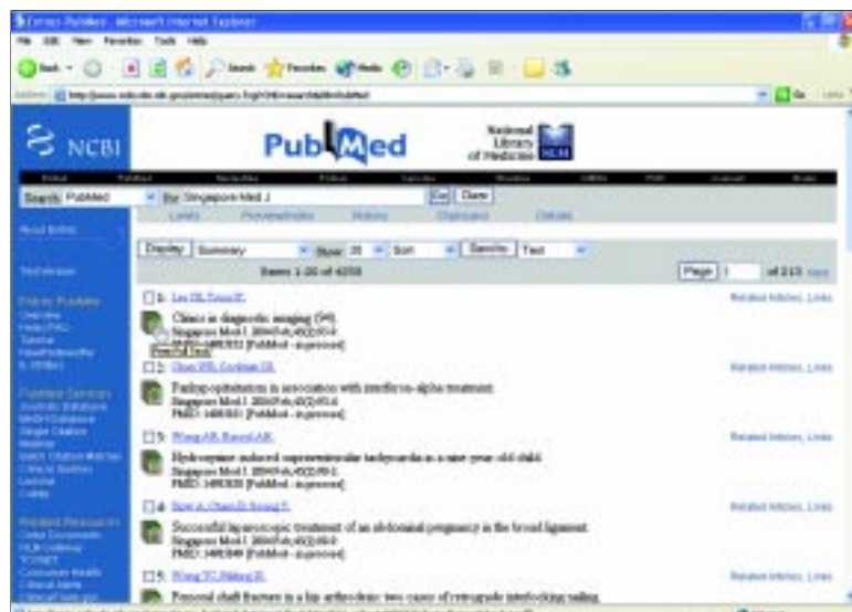
Fig. 1 Page from the PubMed website shows the green icon located on the left side of the citation of a SMJ article, indicating that this citation has a LinkOut feature. Clicking this green icon will lead the user to the abstract shown in Fig. 2.

By clicking onto the green icon (Fig. 1) located on the left side of the SMJ article citation listed on PubMed, a customised SMJ icon will now