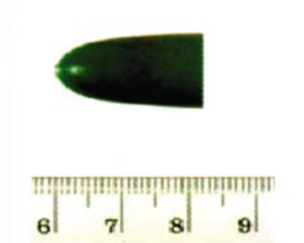
Fig. 4 Photograph shows the plastic feed of a fountain pen.

Our four cases of foreign body aspiration, two with betel nuts, one with tamarind seed and one with plastic feed of a fountain pen, demonstrate the potential considerable morbidity associated with this condition. Three of our patients presented many months after the inhalation episode, and one did not even remember the initial episode. The diagnosis was missed previously in all cases, and in one case, two courses of anti-tuberculous therapy were given