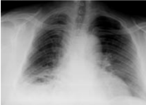
Fig. 1 Chest radiograph shows right lower lobe bronchiectasis and partial collapse.