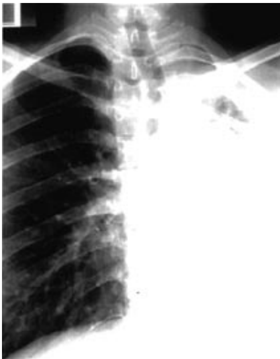
Fig. 3 Chest radiograph shows extensive left-sided fibrosis.

endobronchial mass was seen in right lower lobe bronchus (Fig. 2). An endobronchial biopsy was done which revealed vegetable matter. She subsequently underwent a rigid bronchoscopy and removal of the foreign body from the right lower lobe bronchus. The foreign body was confirmed to be a tamarind seed. She recovered from her pneumonia. However, she had significant residual bronchiectasis.