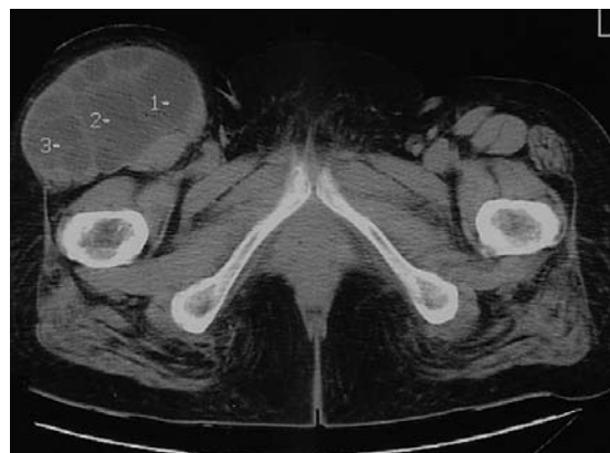
Fig. 1 Case 1. Axial CT image shows a large multicystic hydatid lesion in the anterior right thigh.

Human echinococcosis is a parasitic disease known since the ancient times; Hippocrates first described it as being located in the liver, and introduced methods of treatment. The disease is still endemic in many countries, such as Greece, other parts of Eastern Europe, South America, Australia and South Africa. It is caused by the tapeworm Echinococcus with E. granulosus being the most common form and the most frequent aetiological agent, although occasionally E. multilocularis is the infective agent. (1-4) In this report, we present two cases with uncommon location of hydatid disease that were successfully managed in our hospital during the last two years.