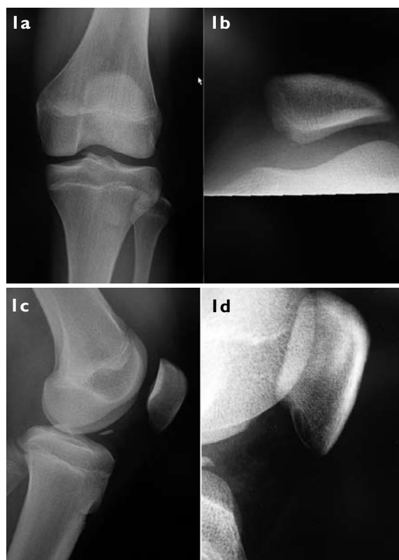
Fig. 1 (a) Frontal, (b) skyline, (c) lateral and (d) close-up lateral radiographs show an oval loose body located in the anterior intercondylar area. There is also a defect in the medial facet of the patella.

A 15-year-old schoolboy presented to our clinic with sudden onset of locking of his left knee. One day prior to the presentation, the patient had been practising dancing in school when he thought he had "twisted" his left knee, which promptly gave way and caused him to fall on the stage. Immediately after the fall, he found his left knee to be swollen and locked in extension; this remained so until he was seen in the clinic.