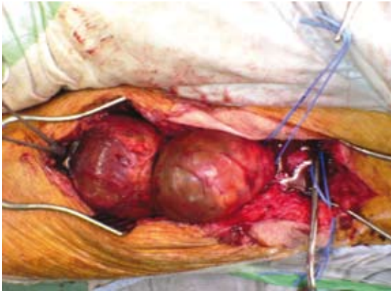
Fig. 1 Clinical photograph shows the superficial femoral artery aneurysm measuring 25 cm in length.