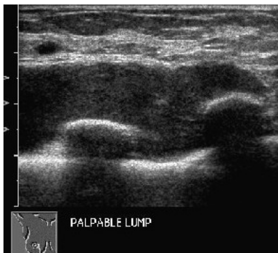
Fig. 2 US image of the right breast shows an elliptical hypoechoic collection deep in the right mammary layer in the lower inner quadrant of the right breast.