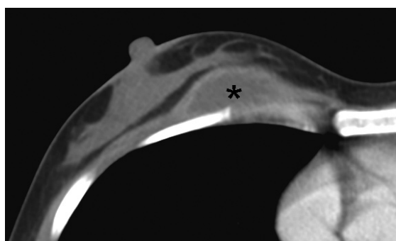
Fig. 4 CT image of the thorax shows a hypodense collection in the right chest wall (asterisk), corresponding to the fluid collection seen on US.

lobes and in the superior segment of the right lower lobe. Ultrasound-guided 14-gauge core needle biopsy was performed and this revealed necrotising granulomatous inflammatory tissue with rare acid-fast bacilli, consistent with a tuberculous infection.