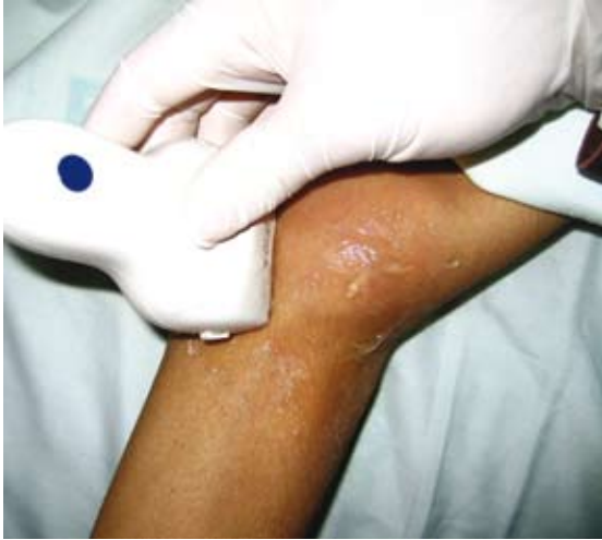
Fig. 2 Photograph of the left cubital fossa shows compression of the pseudoaneurysm neck under ultrasound guidance.

was not receiving anticoagulants, and platelet count and coagulation studies were normal. After obtaining verbal informed consent, the compression of the PA neck was applied for two 20-minute periods with a two-minute interval (Fig. 2). The distal pulse at the wrist was checked frequently by an assistant. Although compression was difficult because of the size and site of the PA, and flow did not stop completely within the pseudoaneurysm, a clot gradually filled most of the PA, and the patient became asymptomatic. Follow-up US one and four days later confirmed near complete thrombosis.