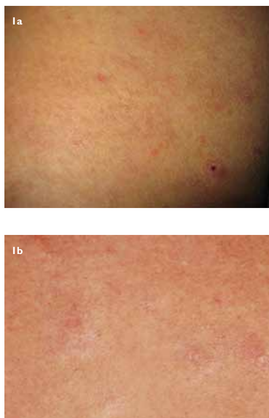
Fig. 1 Photographs show (a) eczematous excoriated papules on the patient's thigh at initial presentation and (b) dermal nodules on the patient's back three years after the initial presentation.

Amyloidoses are a spectrum of diseases comprising both cutaneous and systemic forms, and are characterised by extracellular deposition of amyloid protein as nonfunctional beta-pleated sheets. The cutaneous and systemic types can be further classified as either primary or secondary. Primary cutaneous amyloidoses are more commonly observed in Asians, South Americans and Middle Easterners, with the Chinese being especially predisposed. (1) There are four main types of primary cutaneous amyloidoses with distinctive clinical features: lichen amyloidosis, macular amyloidosis, nodular amyloidosis and amyloidosis cutis dyschromica. Atypical variants include a familial form, a bullous form, (2) diffuse biphasic amyloidosis, (3) poikilodermic amyloidosis, (4) and predominantly hypopigmented macular amyloidosis with or without hyperpigmentation. (5) We report an unusual manifestation of primary cutaneous amyloidosis initially presenting as eczema.