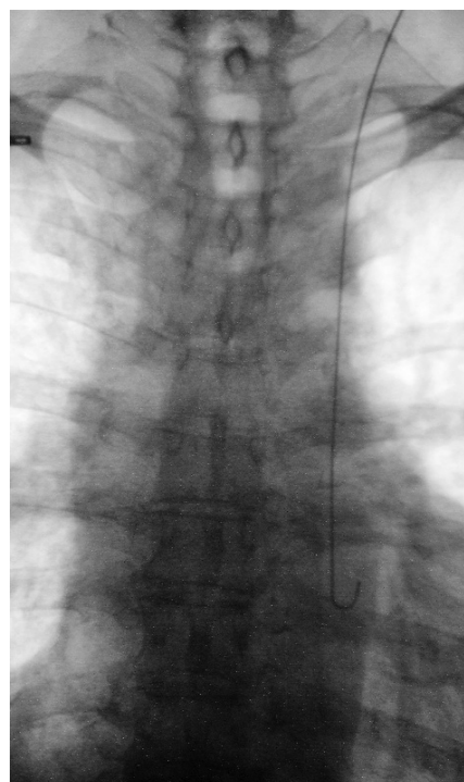
Fig. 1 Fluoroscopic image shows an unusual position of the guidewire along the left paramediastinum following left jugular venepuncture.

A 58-year-old man with diabetes mellitus and end-stage renal failure presented with a one-day history of breathlessness that was not associated with chest pain, diaphoresis or fever. He had a history of aortic coarctation, which was surgically corrected about 30 years ago. The patient had been receiving haemodialysis via a left arteriovenous fistula (AVF). However, this was complicated by stenosis, which was refractory to