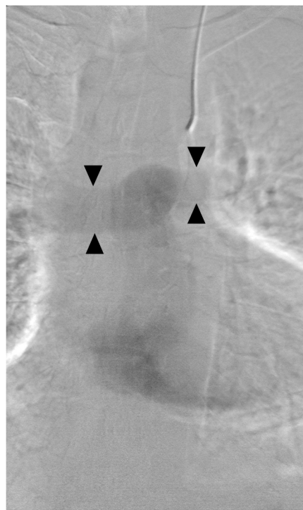
Fig. 3 Slightly delayed digital subtraction angiographic image shows subsequent opacification of the pulmonary arteries (arrowheads).

Digital subtraction angiography (DSA) (Figs. 2 & 3) revealed a PLSVC draining into the right atrium via the coronary sinus. No contrast opacification of the left heart chambers or aorta to suggest a significant vascular shunt was observed. Finally, a HemoStar haemodialysis catheter was successfully deployed within the PLSVC (Fig. 4), with satisfactory flow through both ports. A right brachiocephalic AVF was created three months after the insertion of the haemodialysis catheter. The patient was haemodialysed through this catheter for a total of five months, until maturity of the AVF.