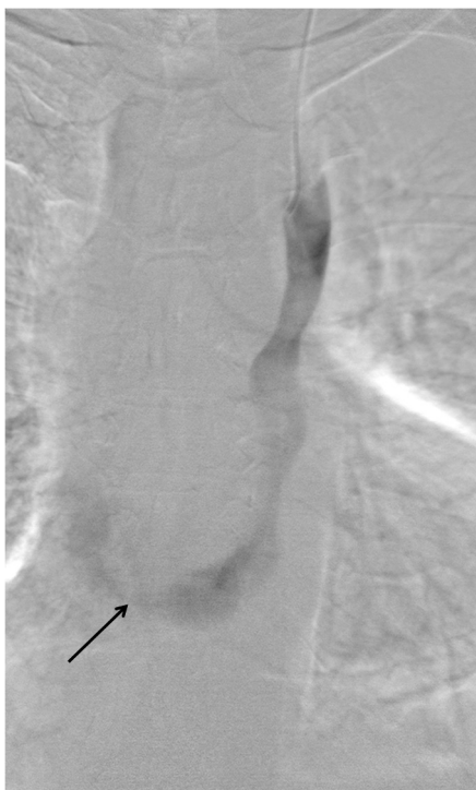
Fig. 2 Digital subtraction angiographic image shows a persistent left superior vena cava draining into the right atrium via the coronary sinus (arrow).