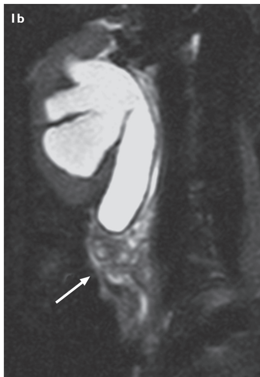
Fig. 1 (a) Excretory urogram image shows hydronephrotic right lower moiety with smooth-filling defects (arrow) in the mid-ureter. (b) Coronal T2-W image shows the right dilated lower moiety ureter with hyperintense filling defects (arrow).

rare cases of multiple and bilateral appearances have been reported. (3) FEPs are mesodermal lesions consisting of hyperplastic fibroconnective tissue with a vascular stroma that is surrounded by transitional epithelium. (4)