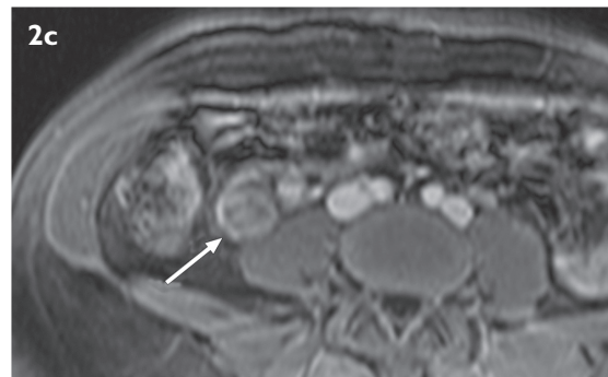
Fig. 2 (a) Fat-suppressed axial T2-W MR image at the level of the fibroepithelial polyp shows the right ureter that is distended with a hyperintense filling defect corresponding to the polyp (arrow). Axial T1-W MR image (b) before gadolinium shows a hypointense filling defect corresponding to the polyp (arrow) (c) that enhances on the post-gadolinium image.

These polyps are classified as benign hamartomas due to their histological organisation; however, malignant degeneration has previously been reported. (5)