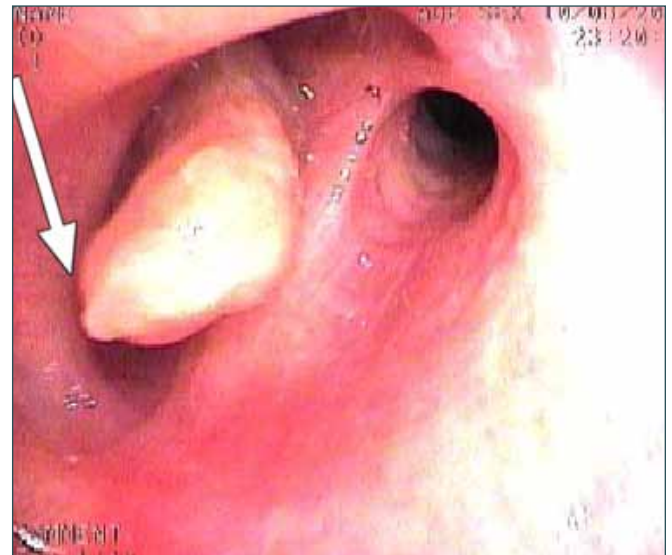
Fig. 2 Flexible bronchoscopic image shows a tumour-like growth completely occluding the anterior segment of the right upper lobe bronchus (arrow).