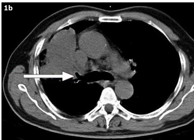
Fig. 1 (a) Chest roentgenogram shows a right upper lobe mass (arrow). (b) Chest CT shows the right upper lobe mass with evidence of narrowing of the right upper lobe bronchus (arrow).