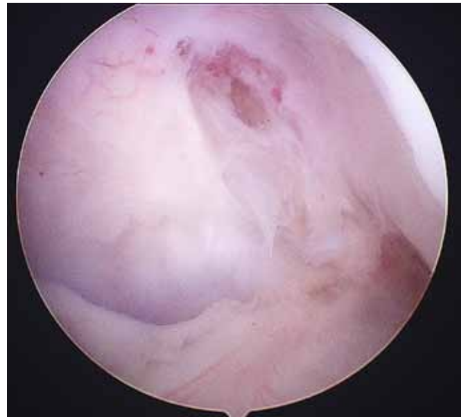
Fig. 3 Anterolateral portal view of the knee after resection of the cyst shows intact posterior cruciate ligament fibres (after debulking).