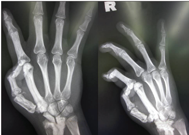
Fig. 2 Radiographs show a well-circumscribed, dense sclerotic appearance of the phalanges and metacarpal bones of the thumb and index finger. Sclerotic areas and opacities are present within the scaphoid, lunate, trapezium, trapezoid, capitate, distal radius and the supracondylar processes of the bilateral humeri.

of the left humerus showed the classic ‘flowing candle wax’ appearance, with sclerotic regions in the radius, carpals, metacarpals and phalanges. Magnetic resonance (MR) imaging of the right wrist revealed thickened bony cortex of the distal radius, ulna, scaphoid, lunate, trapezoid, trapezium, capitate, the first and second metacarpals, and the phalangeal bones,