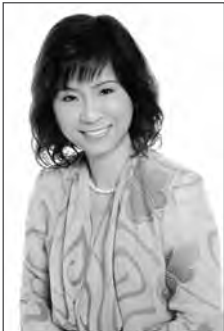
Dr Amy Khor

I am thus very heartened to note that the Organising Committee has chosen the theme of 'Integrative Care – Towards Better Patient Outcome', and has brought the various healthcare disciplines together for this very meaningful 2½-day conference. To deliver top quality care for our patients, we need to constantly review and improve the way patient care can be delivered in a well coordinated fashion. The format of having interactive discussions across disciplines within the domains of 'Fast Medicine', 'Cruise Medicine' and 'Slow Medicine' promises to be very interesting. I have no doubt that over the course of the conference, Alexandra Health System will be able to bring the notion and practice of collaborative healthcare to new heights.